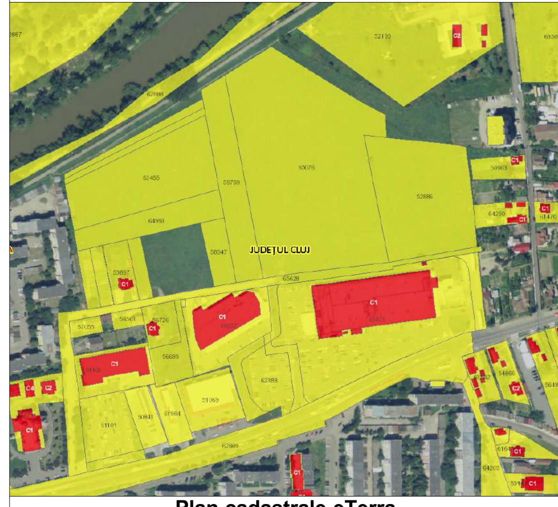
Plan cadastral eTerra